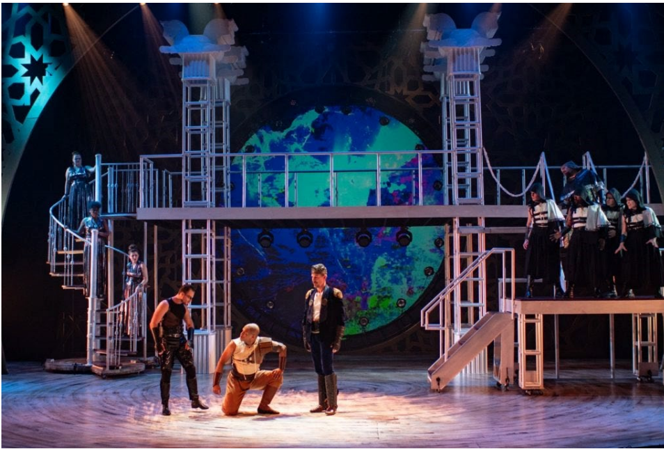
The set of Esther with some of the projections used during the show. Micheal Mullins served as projection designer for the production.

so many ways to be a little bit more extroverted as an introverted person. And that's helped tremendously in these instances."